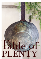
TABLE OF PLENTY

Rachel became a USA citizen in July! We are so proud and happy for her!